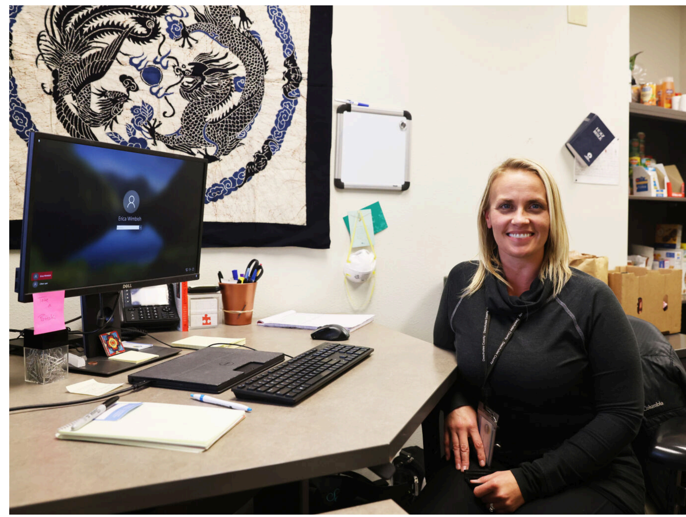
RESIDENT SERVICES/ COMMUNITY PARTNERS