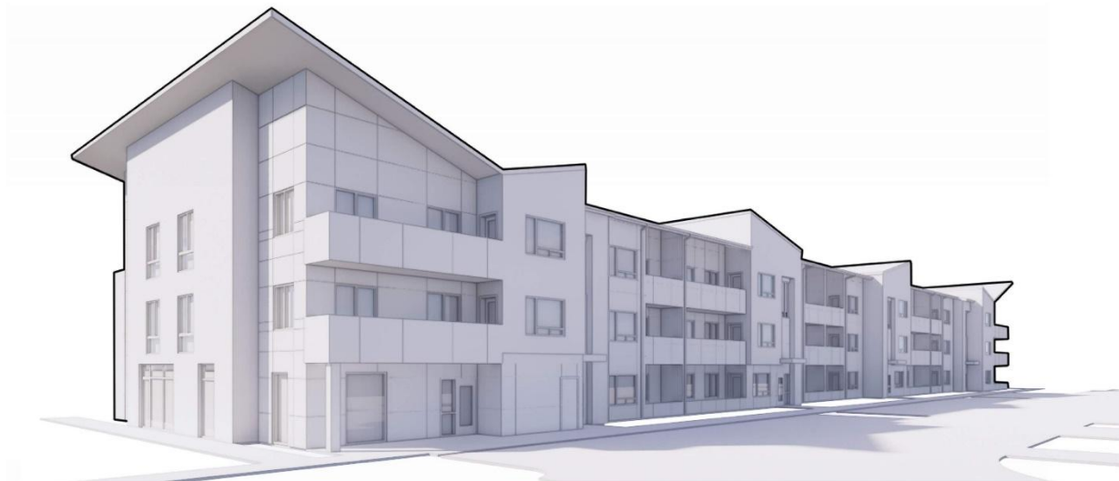
PERSPECTIVE I (SOUTH - EAST)