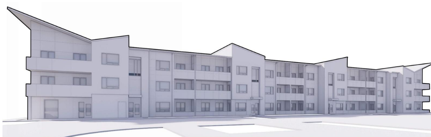
PERSPECTIVE II (SOUTH - EAST)